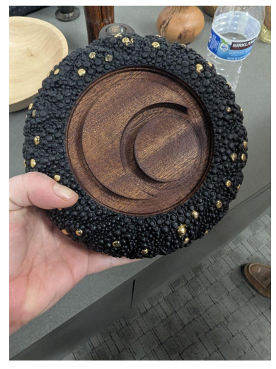
Bowl bottom with two non-concentric mortices.

At the meeting, Brad demonstrated how to turn a multi-axis or offset bowl. He set up his bowl with multiple mortises on different turning axis - as you can see from the picture showing the bottom of his finished bowl. This allowed him to carve out the interior in a non-concentric location - as can be seen in the top view of his bowl. Note that the embellished sample was premade.