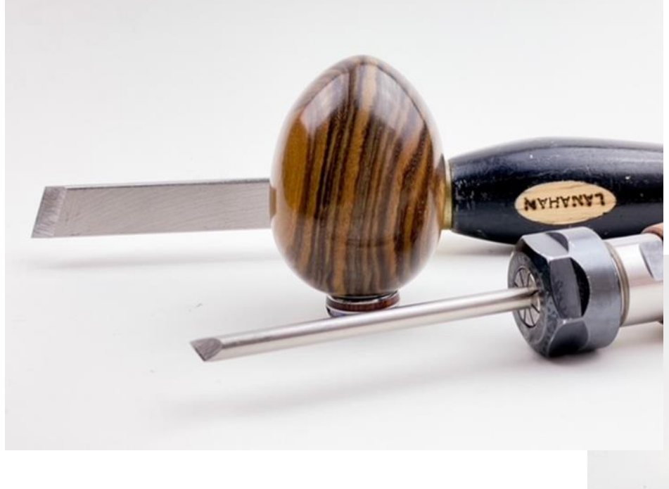
Egg with Skew 2-15'16" tall Texas Ebony, Ebenopsis Ebano Buffed